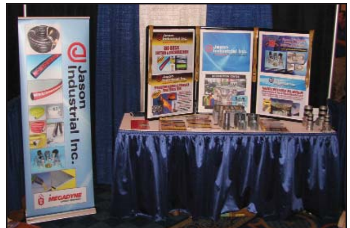
Jason Industrial booth